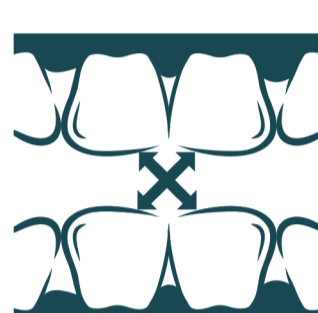
UNDERBITES, OVERBITES, OR CROSSBITES