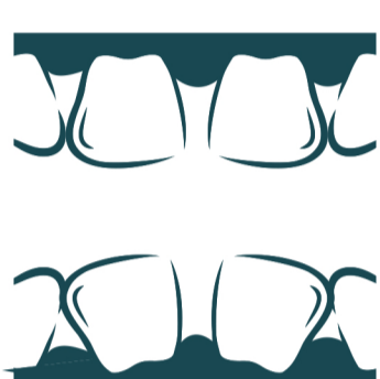
GAPPED OR CROOKED TEETH